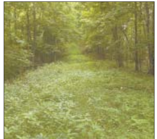
An improved forested right of way on SGL 302