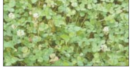
A good stand of clover developed on SGL 302