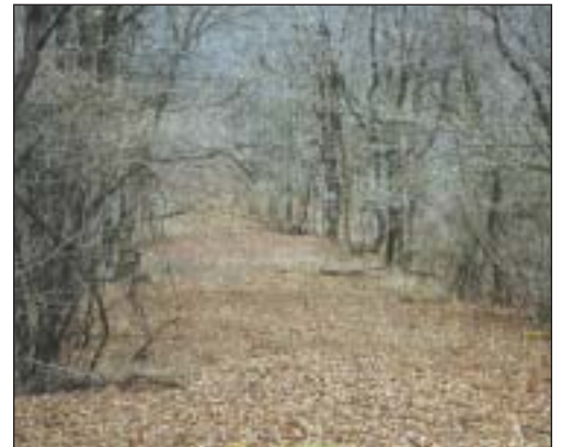
A forested transmission line on SGL 302 before improvements made with this project